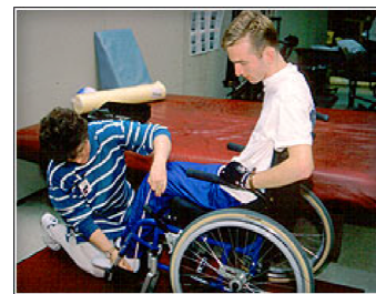
TM with Client

Therapists and/or Complex Rehab Providers with ATP certification can be found at: http://www.resna.org/certification-directory.dot